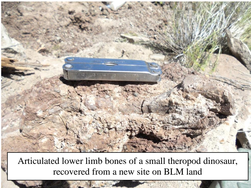
Articulated lower limb bones of a small theropod dinosaur, recovered from a new site on BLM land

In addition to excavation work at the CMQ, the field party explored other nearby exposures of the Morrison Formation in search of new vertebrate fossil sites. Of particular interest was a site discovered in 2016 that appeared to preserve part of a small theropod dinosaur. In addition to the isolated remains collected last season, we recovered an articulated partial hindlimb of the individual as well as portions of a small turtle; these specimens were field jacketed and are currently being prepared at the Sam Noble Museum. There are expansive outcroppings of Morrison Formation near this theropod site that will be the focus of future exploration.